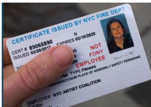
A sample C-14 card

Need to transfer a C-14 permit from another institution? We can help! See our website for more details (see the QR Code below)